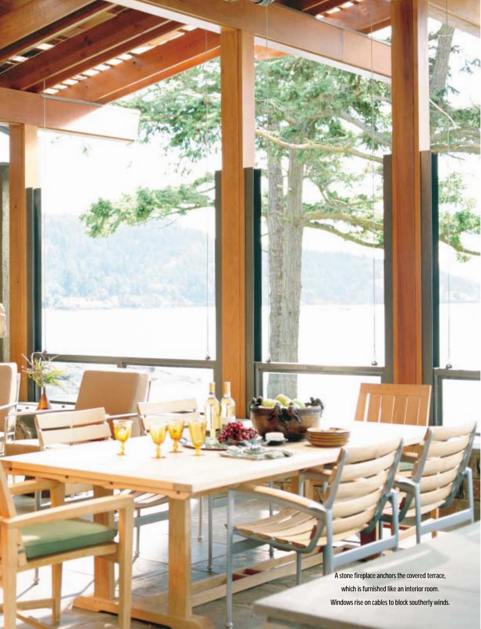
A stone fireplace anchors the covered terrace, which is furnished like an interior room. Windows rise on cables to block southerly winds.